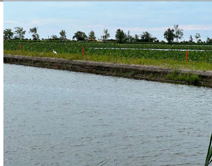
Photo 3: The south separation berm (looking southeast) – this northern slope has experienced significant sloughing due to construction activities; plastic bollards placed by DTE on both sides of the berm have been impacted on the northern edge.