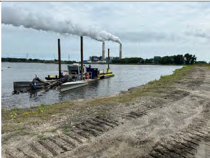
Photo 7: Looking northwest from the south separation berm; dredging activities associated with impoundment closure continue.