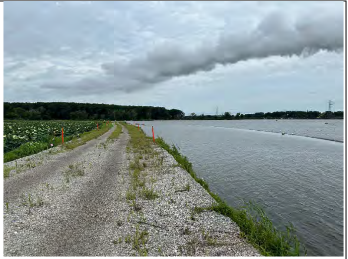
Photo 6: Looking west from the eastern edge of the southern separation berm