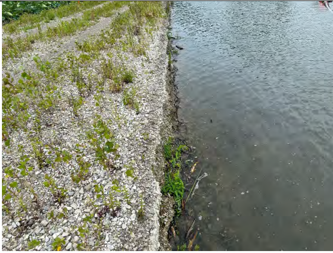
Photo 5: Sloughing along separation berm – material appears to be at angle of repose below the water surface and stable.