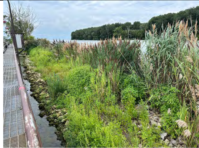
Photo 1: Looking south at discharge weir; heavily vegetated at discharge as water levels continue to decrease along the discharge canal