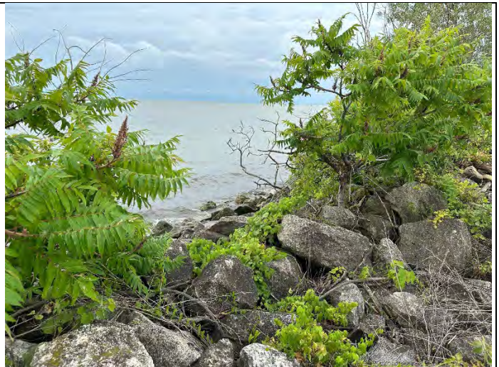
Photo 8: Heavy rip-rap along the eastern shore of the perimeter dike facing Lake Erie. No changes are noted in this area.