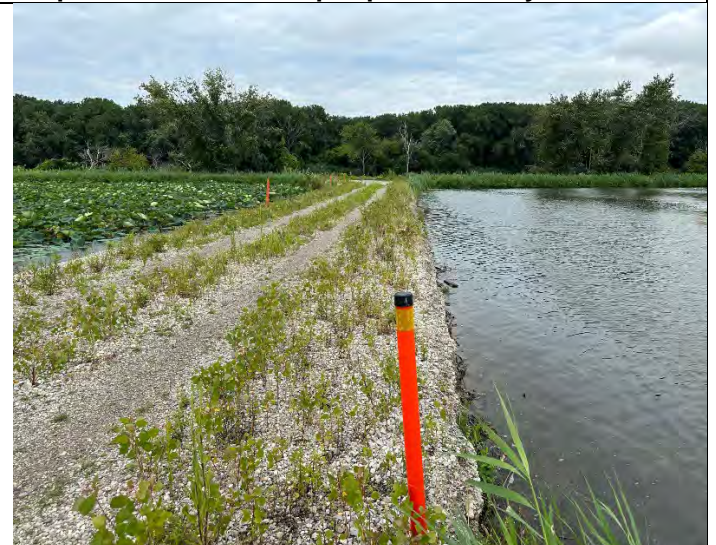
Photo 4: Another view of the southern separation berm (looking west) showing the area affected by increased sloughing