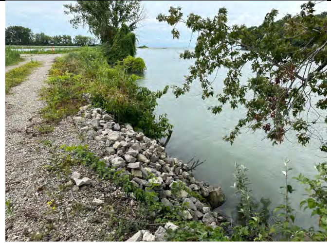
Photo 2: Area of sloughing along discharge canal that was augmented by rip-rap placement in previous years. Slope looks stable; DTE personnel monitor suspect areas without rip-rap on a weekly basis