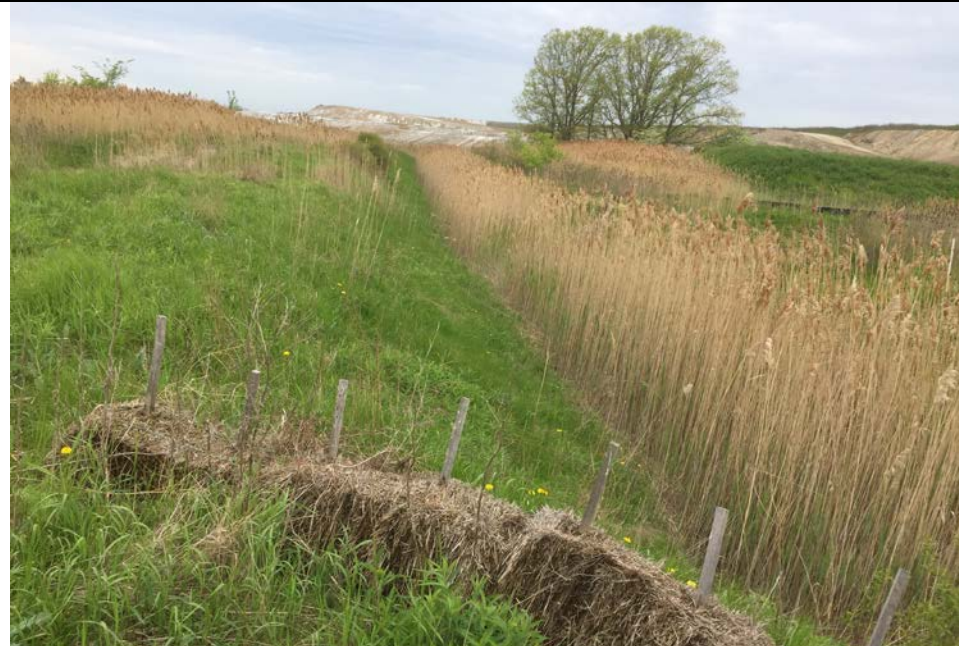
41. Slope Along Internal Ditch. Erosion Control Bails Placed. Vegetation Appeared Heavy and Typical of This Internal Ditch.