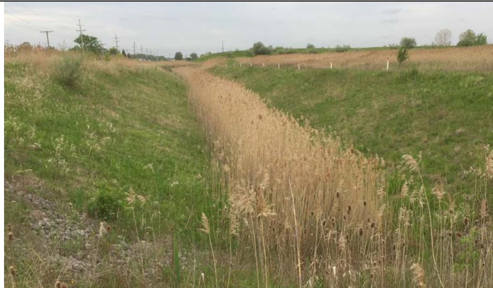
43. Looking West at Perimeter Ditch and Slopes Along NW Landfill Corner. Slopes Appeared Stable and Typical. Riprap at Inlet of Culvert Road Crossing.