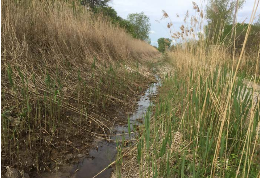
15. Perimeter Ditch Shown Here was Previously Cleaned. Riprap Along Ditch Noted. Flow Observed.