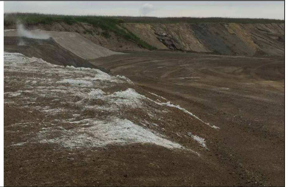
36. Active Waste Placement Area.