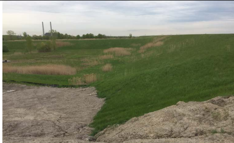
23. View of Perimeter Landfill Slope Along East Side.