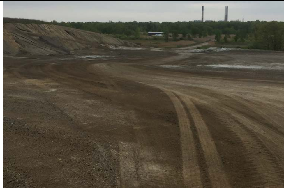
37. Interior Haul Road Leading into Active Waste Placement Area G2. Compacted Waste Supporting Haul Trucks without Rutting.