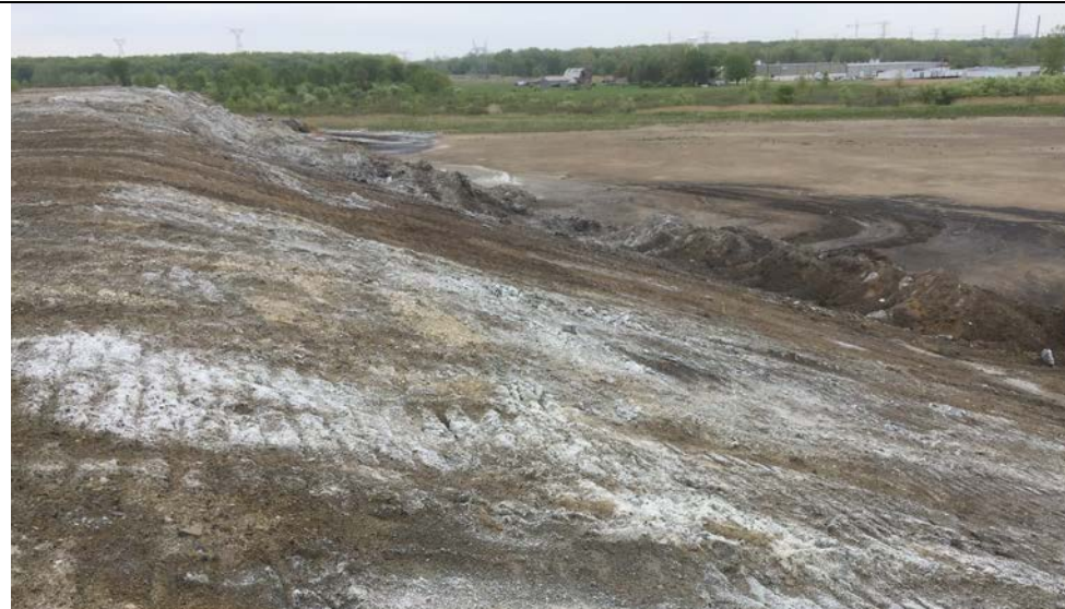
39. View of Interior Waste Slope in Area G2. Truck Dumping at Toe of Slope. Bottom of Slope Runoff Causes Some Wet Conditions as Shown in Photos.