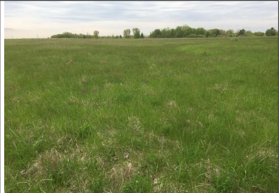
26. View of the Top of Closed Portions of the Landfill with Center Swale. Top Well Vegetated. No significant Surface Erosion Noted During Travel.