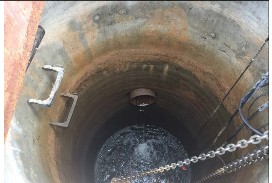
18. Sump Where 2 New Pumps Installed Last Year. Off-site GW Inlet Pipe Shown. Control Panel and Pump Operation Verified by DTE Inspector.