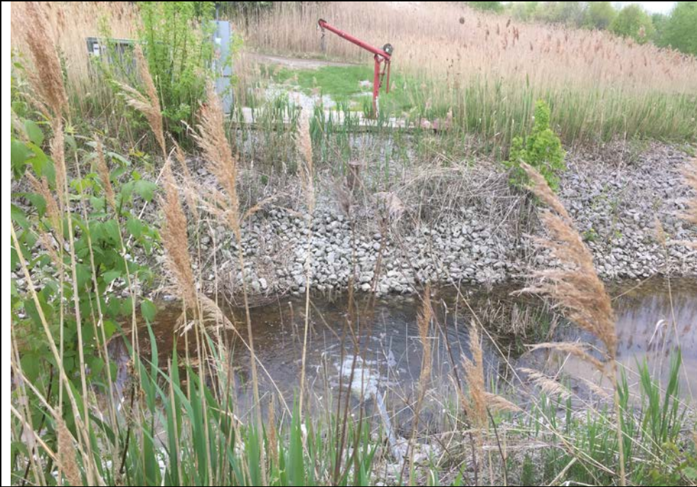
21. Photo of Offsite GW Capture System Flow into Perimeter Ditch at Pump and Control Panel Location.