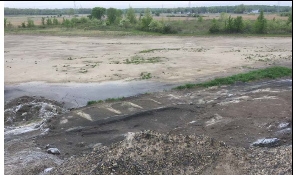
40. Future Waste Placement Area G2 Phase 2.