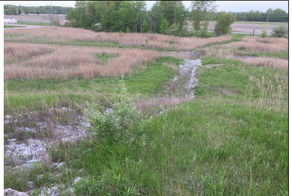
30. Looking Downslope at Downchute of South Slope of Closed Area F2. Small Tree Brush Present Not Causing Any Blockage.