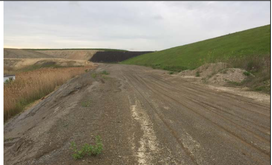
44. View of Interior Haul Road/Inspection Road. Interior Pond on Left in Photo. Area Slope Appeared Stable and Well Vegetated.