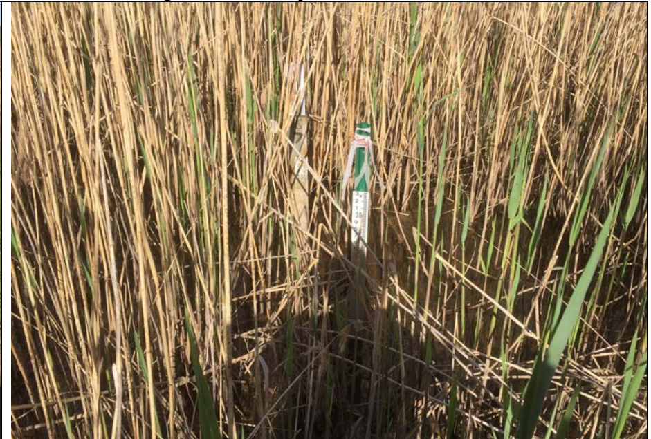
6. Perimeter Ditch Staff Gauge SG-07. Heavy Vegetation. No Flow Noted. Water Present. Vegetation Approx. Typical at Staff Gauges 13, 10, 6, 5 & 3.