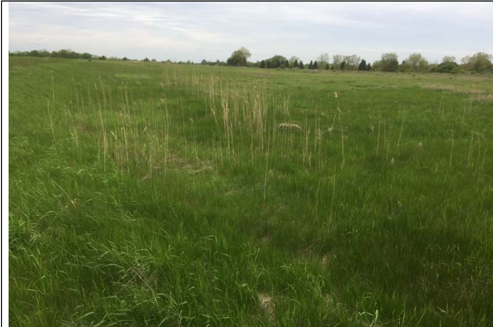
25. View of a Cover Surface Collection Swale Along the Perimeter at the Top of Landfill. Swale Well Vegetated and Typical of Surface Swales Elsewhere.