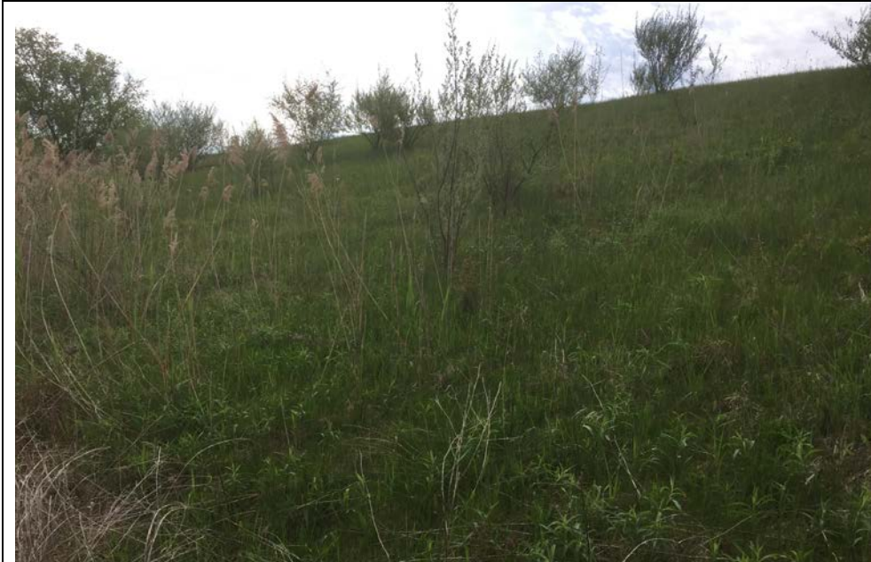
17. Landfill Slope on North Side Shown. Appeared Stable and Well Vegetated.