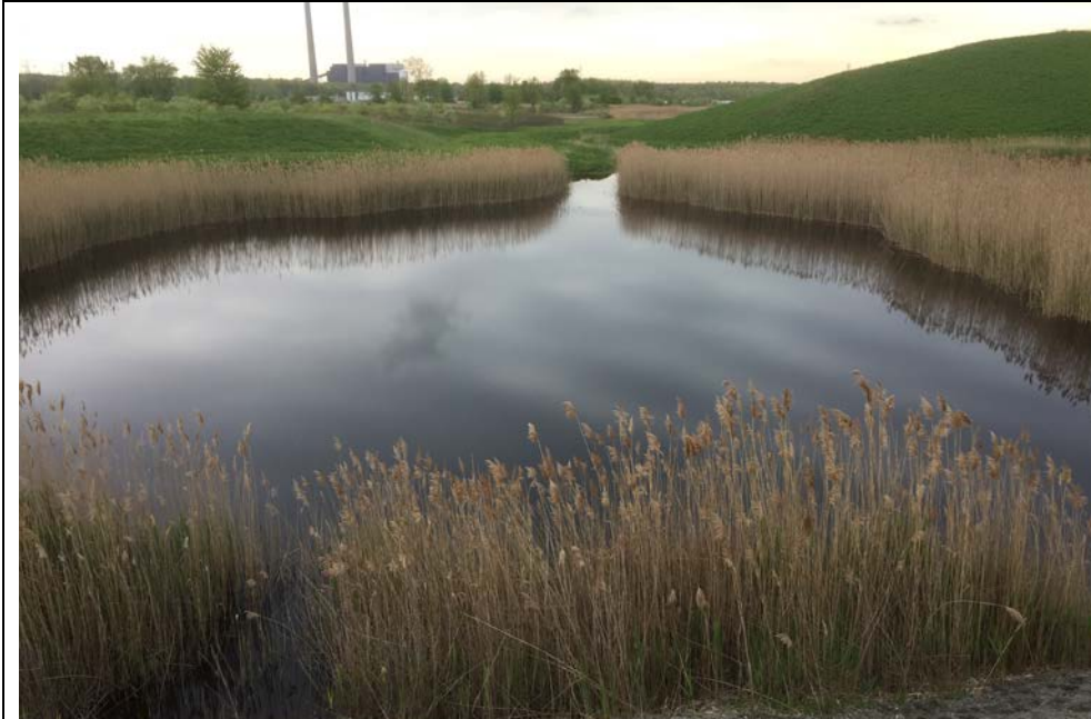
45. Left Side of Pond where Water Exits to Interior Drainage Ditch. Interior Landfill Slope in Background.