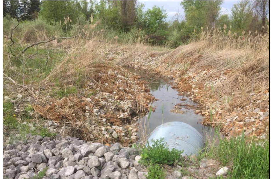
16. Previous Maintenance Along Perimeter Ditch and Culvert Crossing. Both Sides of Culvert Open and Ditch Cleared of Vegetation.