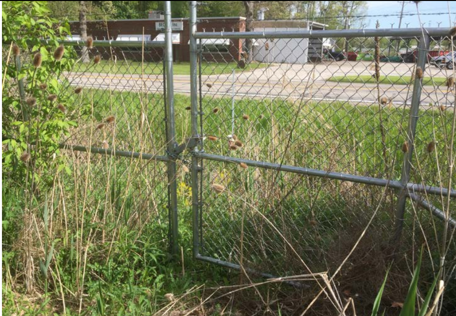
13. Locked Gate in Security Fence Along Perimeter Ditch. Signage not Visible but is Located on Right Side of Gate.