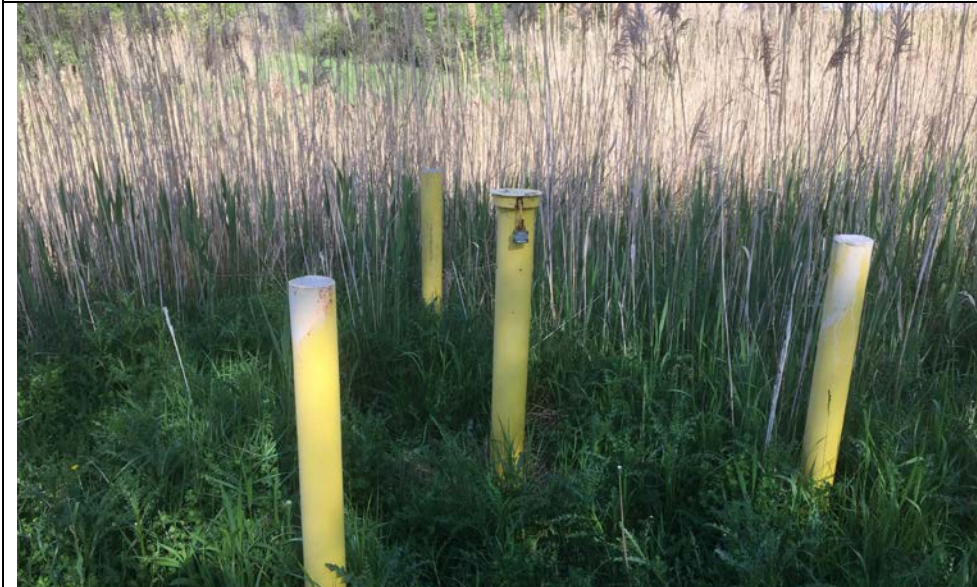
7. Monitoring Well 16-02. Well Protected and Cap Locked. Well Protection and Capping Typical of Inspected Above Ground Monitoring Wells (16-03,04,05&06).