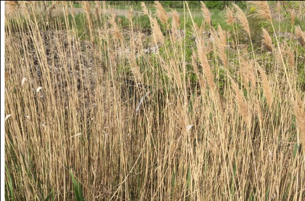
9. View of End of Large Culvert at Crossing Near Staff Gauge SG-5. Culvert Opening and Not Blocked.