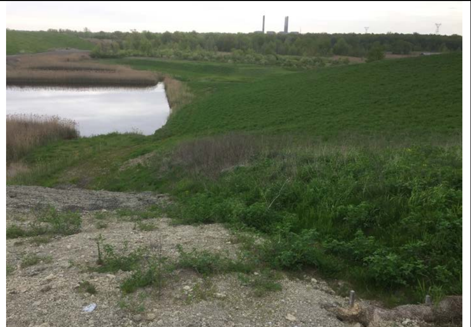
46. Right Side of Collection Pond. Landfill Slopes Appeared Stable. Surface Runoff Ditch from Interior Road.