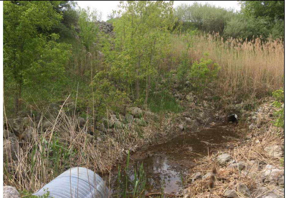
14. Large Culvert and Small Culvert. There was No Blockage of Small Culvert. Riprap Downchute from Closed Landfill Area Slope Visible.