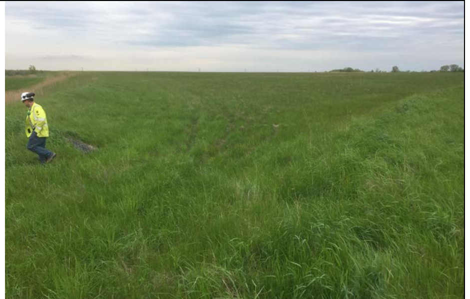
24. DTE Inspector Checking Slope Drainage Channel. Channel Swale Open and Well Protected with Slope Vegetation.