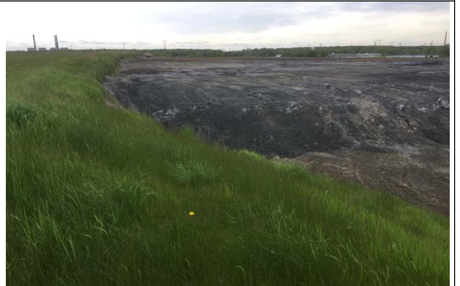
32. Waste Placement in Area G2 Phase 1 Along Temporary Slope of Area F2.