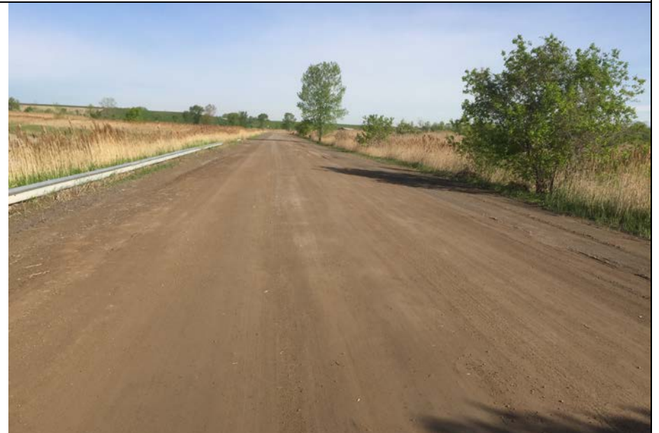
4. Looking at Well Maintained Haul Road within Landfill Limits. Condition Typical of Main Haul Roads to Waste Placement Areas.