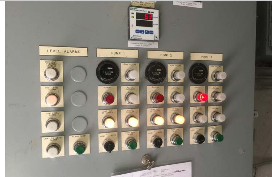
3. Pump Control Panel. Pump #3 Running. Pumps 1 & 2 Identified as Out of Service. Wall Flow Meter (Not Shown) was Operating. Pumps Observed.