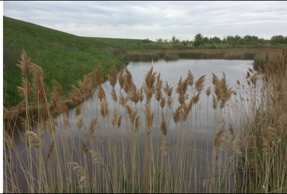
33. Runoff Collection Pond within Landfill Limits. Landfill Area Slopes on Left Appeared Stable and Well Vegetated.