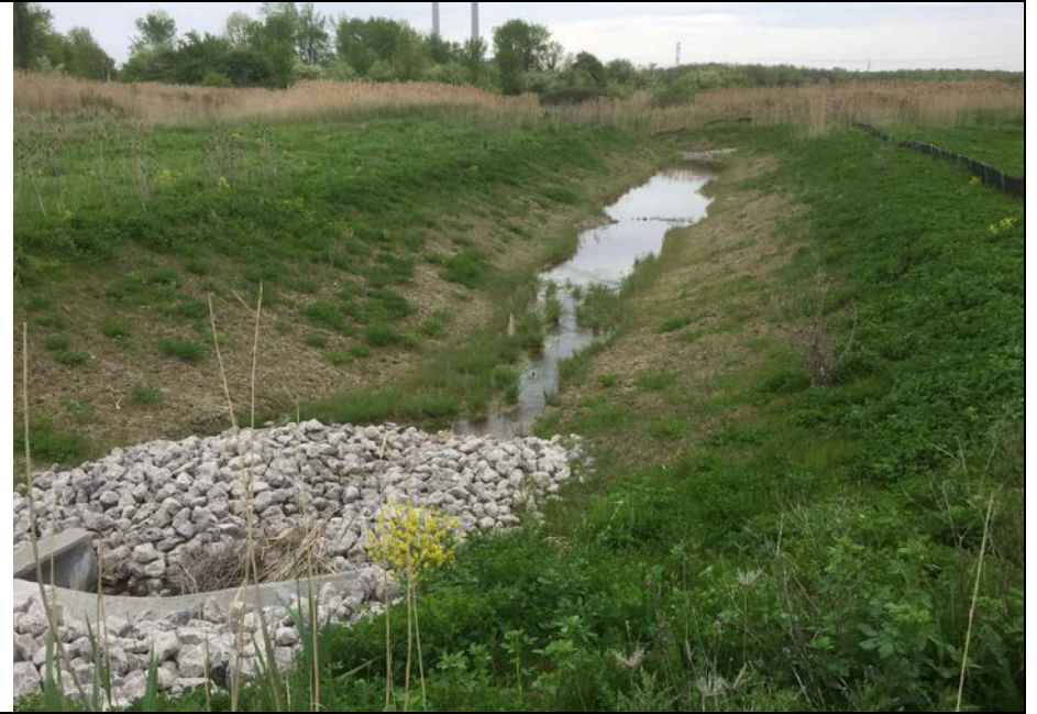
34. Interior Landfill Drainage Ditch. New Routing of Ditch. Slopes Appeared Stable. Check Dam at Far End of Photo. Same as 2018 Photo 76.