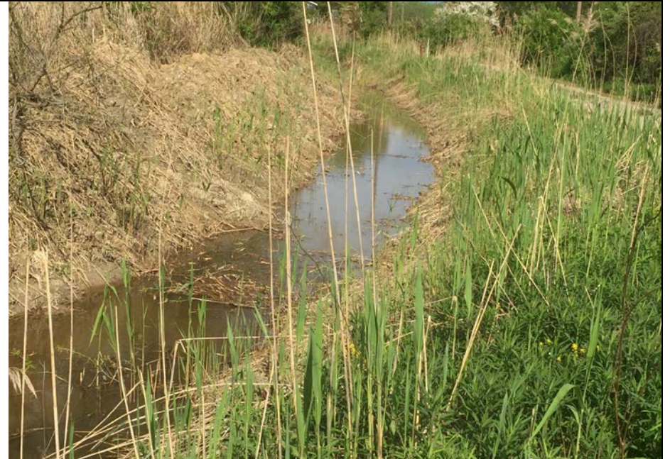
10. Looking at Last Year's Maintenance Along East Side Perimeter Ditch. Ditch Cleared of Vegetation. Road Also Remains in Good Condition.