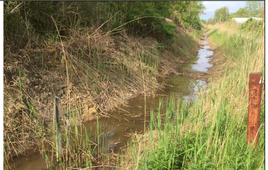
12. Looking at Perimeter Ditch, Staff Gauge SG-02 and PZ-1R. Ditch Cleared of Vegetation in 2018. Same Type Clearing at SG-01 and