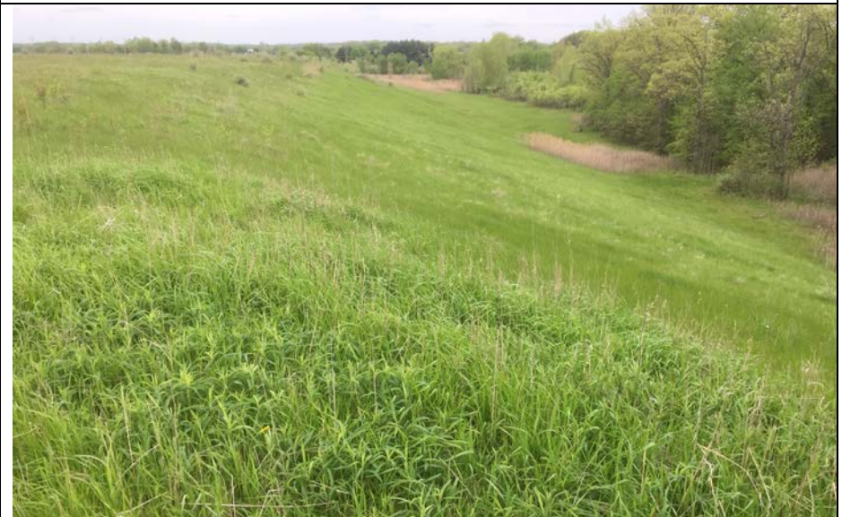
28. A Look Back at Perimeter Slope of Closed Portions of the Landfill. Slope Well Vegetated and No Visual Evidence of Stability Problems.