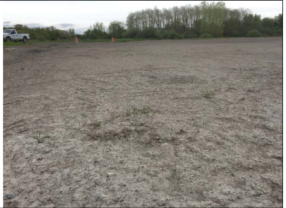
22. Top of Clay Stockpile for Later Use. Surface Graded for Drainage. Rainfall Previous Day/Night.