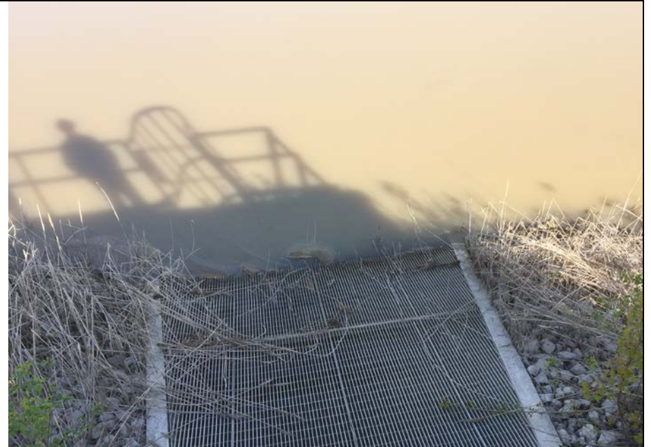
2. Intake Screens at SWDB. Water from Basin is Pumped Back to Power Plant Using One or More of 3 Pumps. DTE Inspects Daily and Records