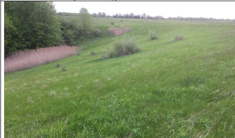
27. View of Perimeter Slope East Side. Well Vegetated, Appearing Stable but with a few Clumps of Brush Vegetation.