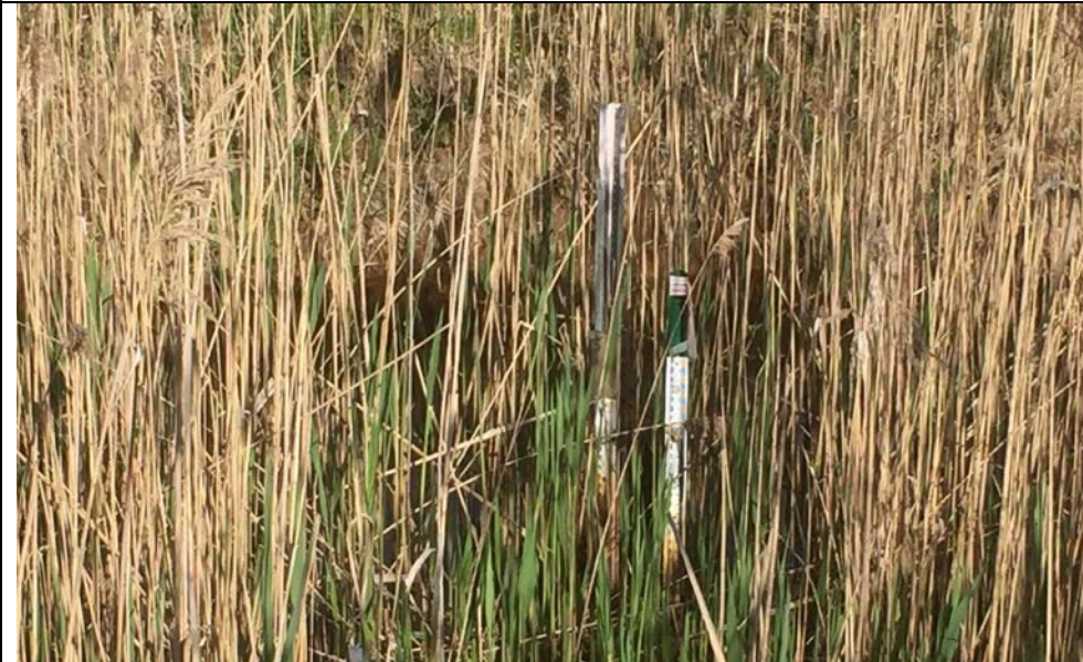
11. Looking at SG-03. Ditch Flow Observed. Vegetation Thick but Not Blocking Flow.