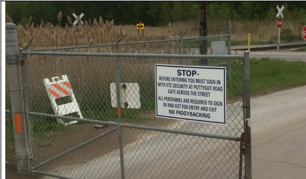
47. Main Entrance Gate to Landfill. Plant Area Road and Security Gate Manned Office to the Right (Not Shown). Gate Opened for Our Exit by Inspector.