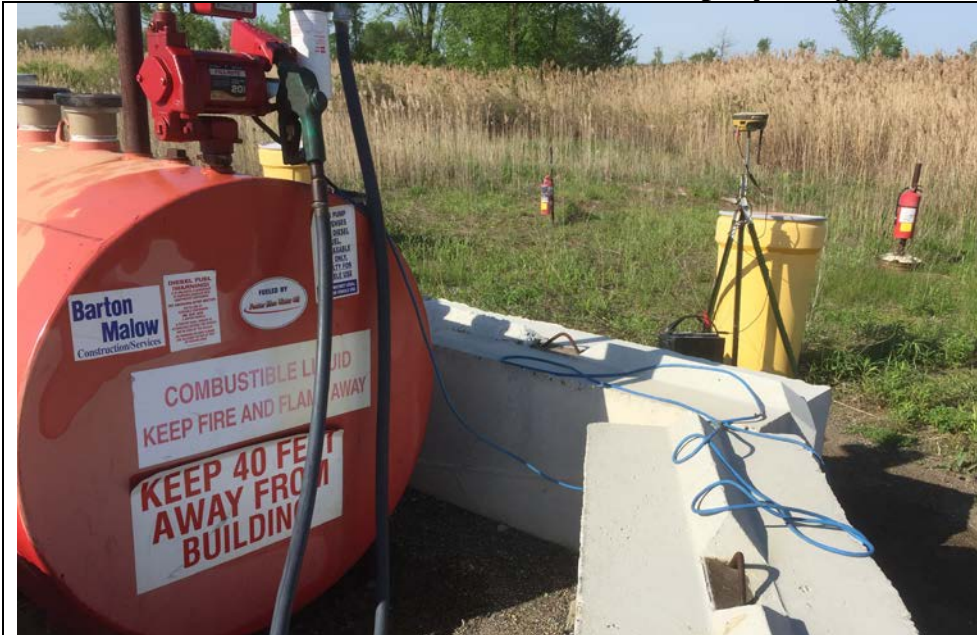
5. Second Fuel Tank Appeared to have Possible Dispensing Leak. DTE Informed Contractor Management and Repairs were Later Reported Completed.