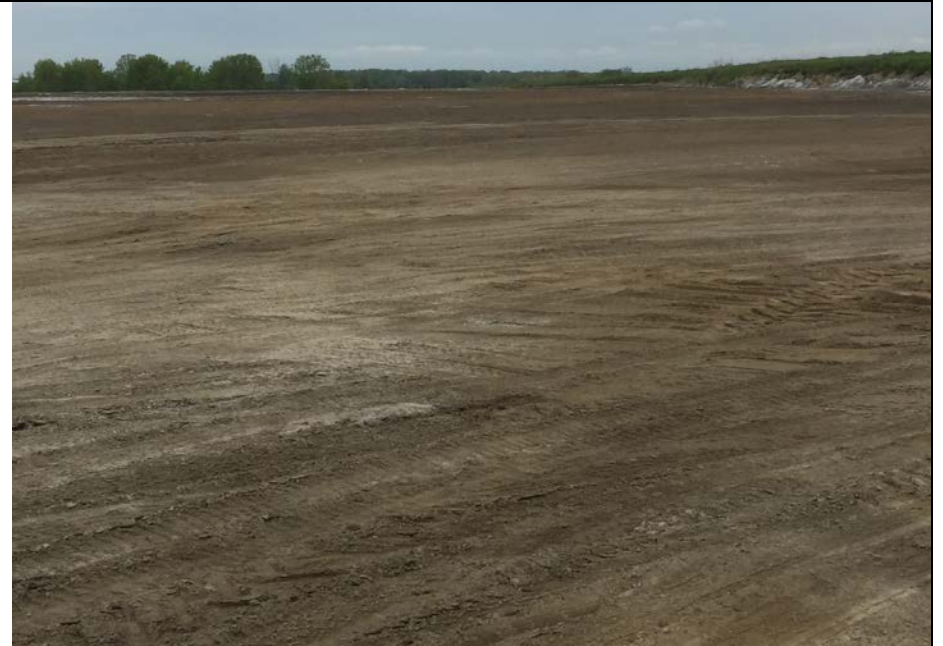
38. Top of Active Placement Area G2, Graded and Used as Interior Haul Road.