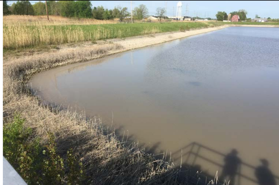
1. Storm Water Detention Basin (SWDB), S & W Sides. Slopes are Protected with Stone. No Visible Slope Erosion on all Sides. Same for N & E Sides.