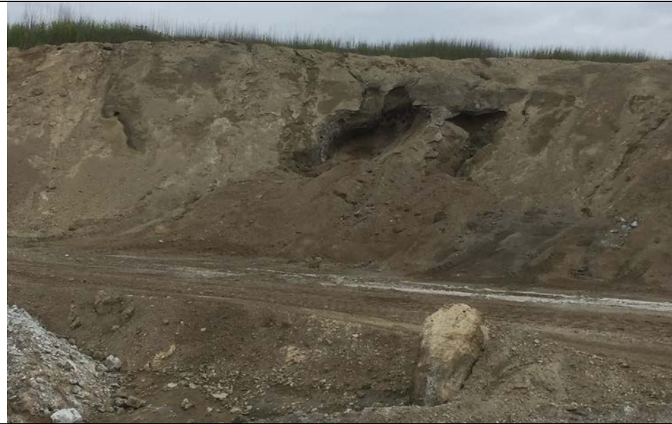
35. Slope where Some Runoff Erosion Noted Along Side of Active Haul Road.