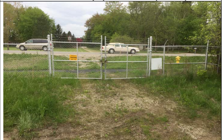
20. Security Fence and Gate at West Side of Landfill. Gate Locked and Signage Present. Typical of Gates Around Landfill Perimeter.