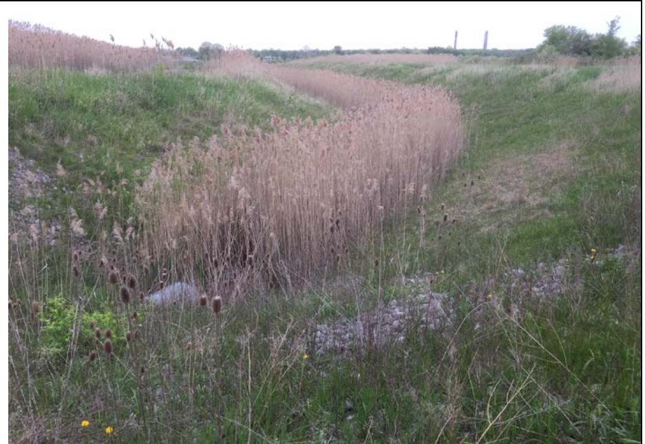
42. Looking East at Perimeter Ditch from Southwest Corner of Property. Culvert for Road Crossing Near Monitoring Well 16-05.