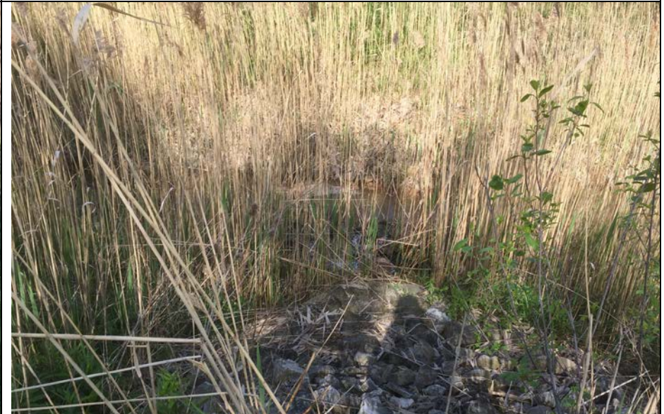
8. View of Area where Discharge Flow into Perimeter Ditch from NE Off-Site GW Capture System. Ditch Slope Vegetation was Cleared in 2017.