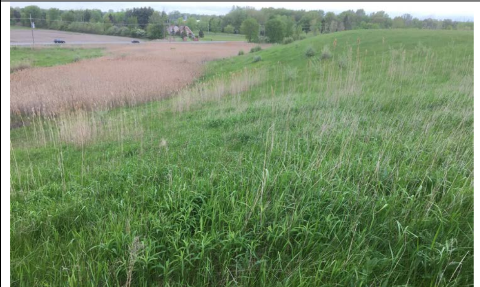
31. Looking West at Landfill Perimeter Slope in Area F1 from Corner of F2. Small Tree/Brush Vegetation Portion of F1 Downstream Slope.