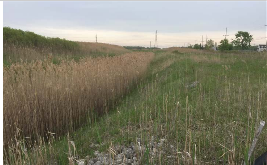
48. Perimeter Ditch on West Side of Landfill Property Looking East from Road Crossing. Ditch Vegetation Typical. Slopes Appeared Stable.