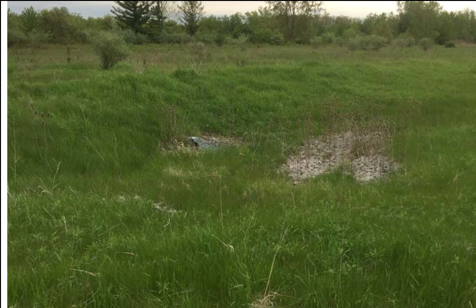
29. Termination of One Drainage Swale Top of Landfill at Downslope Pipe. Riprap was Added Years Ago to Control Erosion During Heavy Rainfall.