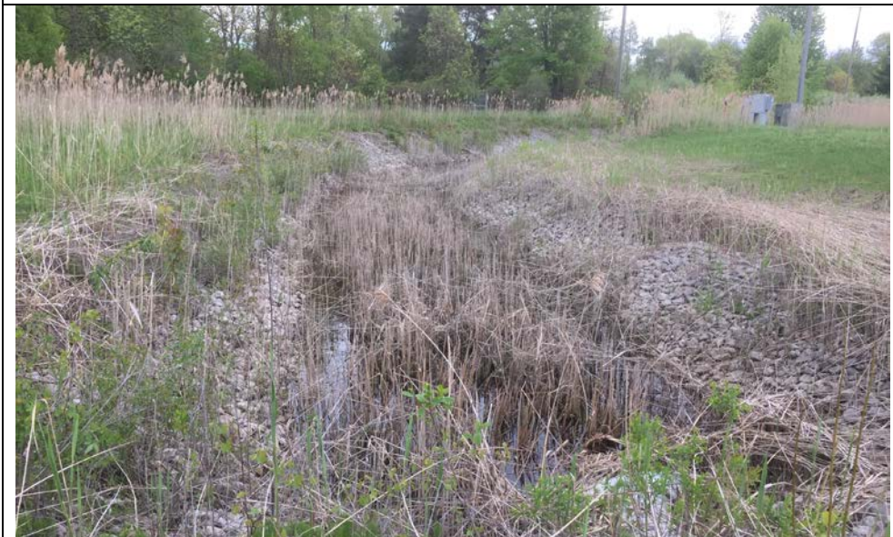
19. Perimeter Ditch Vegetation and Riprap Along Slope. Vegetation Partially Removed but Ditch Flow Appeared Not Blocked.